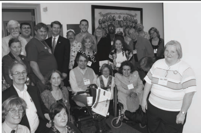
UCW-CWA lobbying delegation to Nashville poses with State Senator Tim Burchett.

UCW - CWA United Campus Workers Communications Workers of America - Local 3865 www.ucw-cwa.org